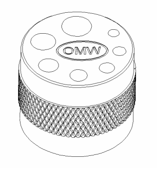
The OMW Tapping Guide Block

The OMW Tapping Guide block was inspired by a guide block used by a fine toolmaker I've had the pleasure to work with. This expert craftsman had made his block as an apprentice, and would use it whenever he tapped a hole. I never saw him break a tap. I took his design, and made it smaller and handier, and in the process moved the hole positions out near the edge to allow the block to be used in tight clearance spaces. I retained the feature of the counterbores on the bottom of the block for chip clearance, as well as