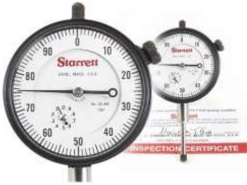
P/N 1835 $99.63