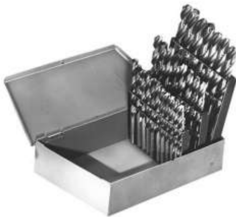
P/N 2829 $85.95

Most of our drill sets are from Republic Drill Corporation in Illinois. Although this drill set is imported, Republic Drill Corporation has a set of standards that guarantee that these are quality drills.