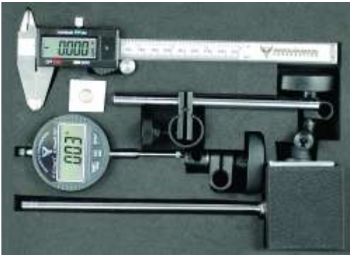
P/N 3073 $89.50