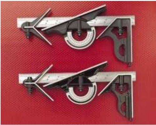
P/N 3589 $195.00