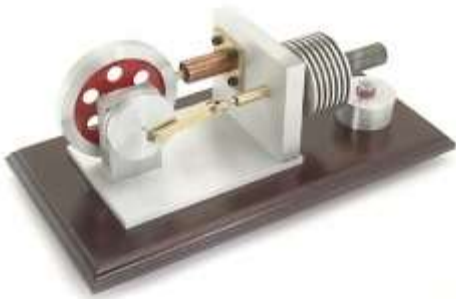
P/N 2213 $189.95

There's no better gift for a mechanically-minded person than a desk accessory that actually runs. These Stirling-cycle engines run with the addition of some denatured alcohol. And they still look great just sitting still.