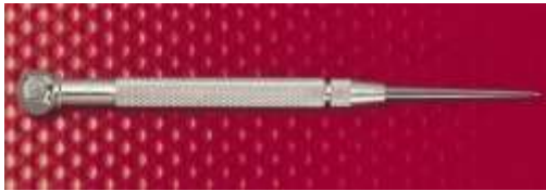
P/N 1824 $8.70

All the Starrett tools in this list are "safe" gifts, as they will be appreciated and used even if the recipient already has one. These Starrett products are listed in order by price.