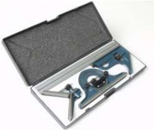
P/N 1250 $36.95

We have a broad range of combination squares and combination square sets that range in price from less than $40 to almost $200.