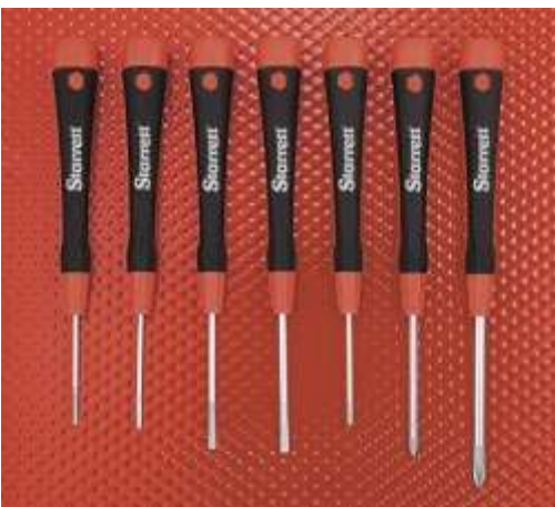
P/N 3178 $47.50