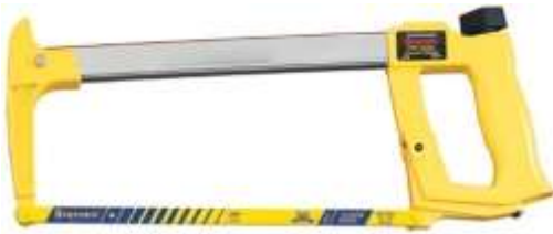
P/N 3562 $35.00