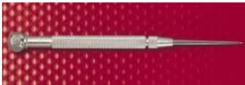
P/N 2655 $11.00