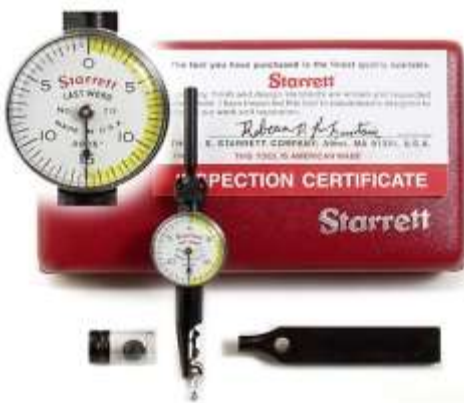
P/N 1819 $146.00