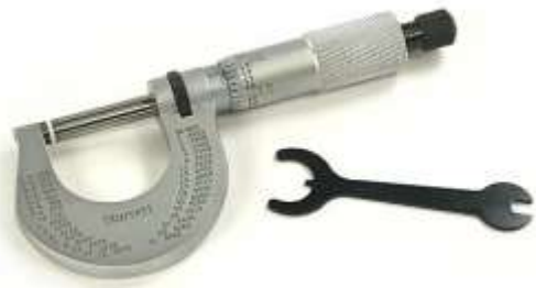
P/N 3180 $142.00