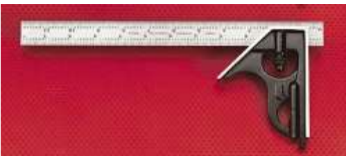
P/N 1839 $65.00