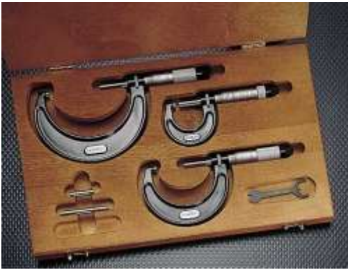
P/N 1836 $492.00