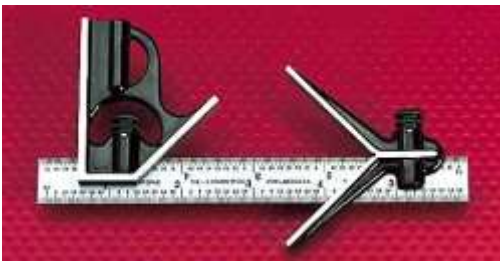
P/N 2656 $117.00