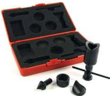
P/N 2907 $14.95