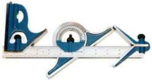
P/N 2738 $99.95

Our imported combination square set is a good starter set at a very affordable price. It includes a 12" stainless steel blade, a square head, a center head, and a protractor head.