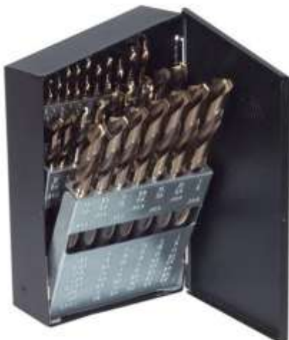
P/N 3591 $119.95