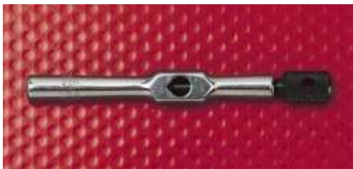
P/N 2621 $19.50