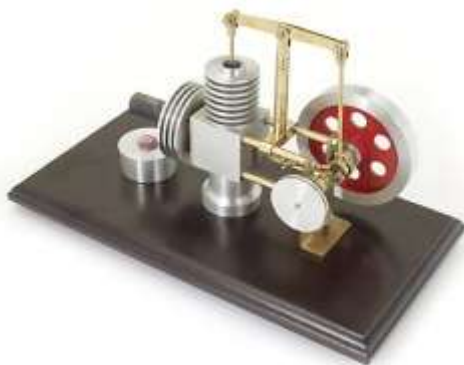
P/N 2212 $215.95

The completed model is 10" long, 4½" wide, and 4" tall. The base is 12¼" long and 6-3/8" wide.