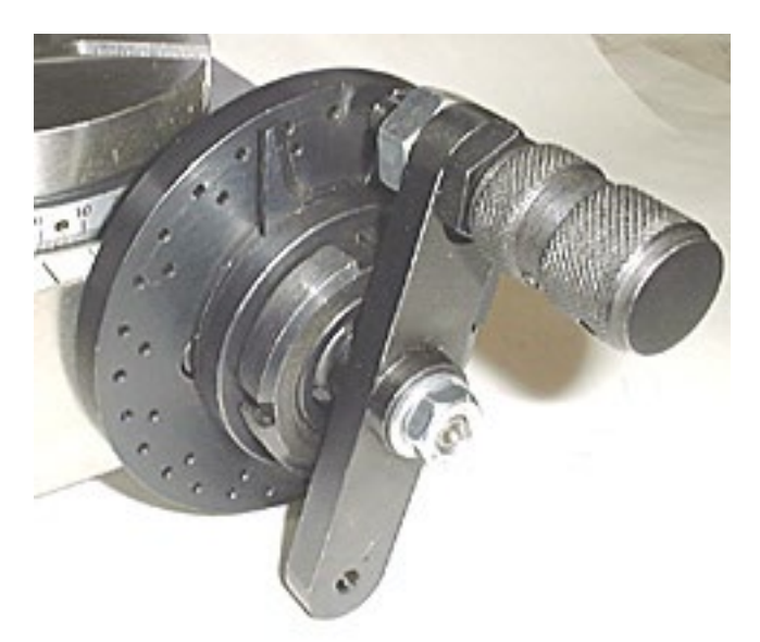
Sector arms set to advance 27 extra holes on the 28-hole circle.

3. Tighten the small setscrew in the outer sector ring.